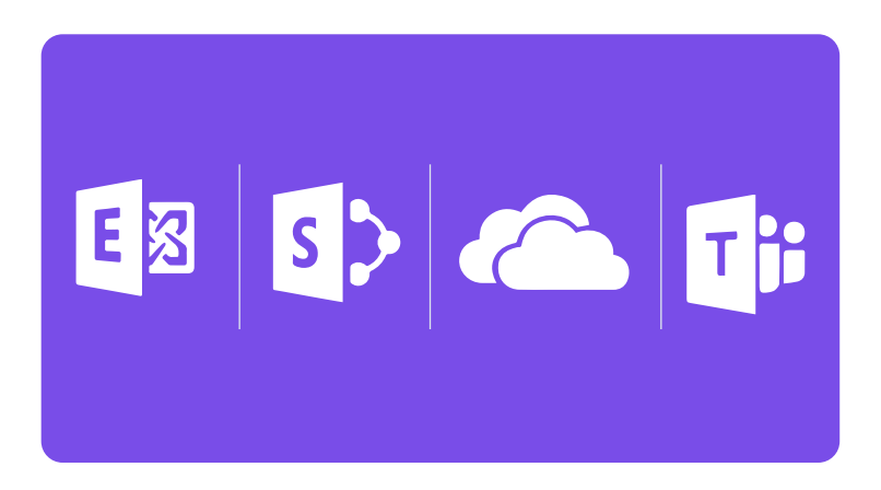
Consider a backup solution that is comprehensive, including Exchange Online, SharePoint Online, OneDrive for Business and Teams.